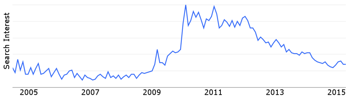
Figure 1. Google Trends results for "Stereoscopic 3D". Vertical-axis is search interest normalized by Google.

That inconsistent pattern of public interest continues today as blockbuster movies such as 2009's Avatar , currently the highest grossing film of all time, reignited tremendous interest which now shows signs of declining. A normalized plot of Google search activity for "stereoscopic 3D" shows interest initially driven by Avatar and then fading (Figure 1). Further evidence suggests that today's resurgence of 3D films may be another fad as sales of 3D film tickets have declined four years in a row in total revenue and seven years in a row in percentage of overall ticket sales (Lieberman, 2014), and sales of stereoscopic home theater systems have fallen below industry expectations (Dash, 2013).