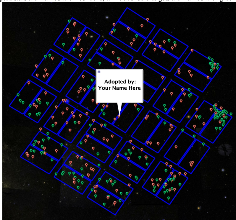
Figure 1. A representation of the Kepler target list in Google Sky. Fainter targets are marked as the user zooms in to individual regions of the telescope field of view (blue boxes). Adopted stars are marked with red icons, while available targets are marked with green icons.

The centerpiece of our outreach and crowdfunding effort was a representation of the Kepler target list in Google Sky, allowing potential donors to browse the locations and basic properties of the stars that NASA was searching for planets. As shown in Figure 1, Google Sky uses a markup language to project icons and other information on top of high-resolution images derived mostly from digitized Palomar Sky Survey photographic plates (Connolly et al., 2008). Any attempt to display all 150,000 targets simultaneously would slow down the computer and ultimately crash the browser. What we needed was a recipe for initially marking the brightest stars, and then gradually highlighting the fainter stars as the user zooms into the field. The open-source regionator software ( https://code.google.com/p/regionator/ ) developed at Google provided exactly the functionality that we needed. It was even distributed with a sample application to display the Swiss national rail network in Google Earth, starting with connections between the busiest train stations but eventually showing all of the connections as the user zooms in. We simply replaced train stations with stars, and used brightness to prioritize the targets.